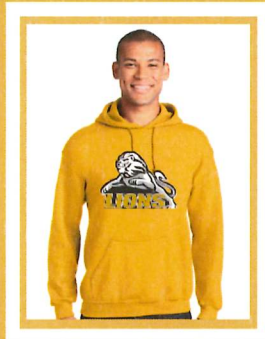
HOODIE COMES IN BLACK, ATH. GREY, GOLD, WHITE 18500B YOUTH M-XL $51.00 18500 ADULT S-XL $53.00 ADULT 2XL $60.00