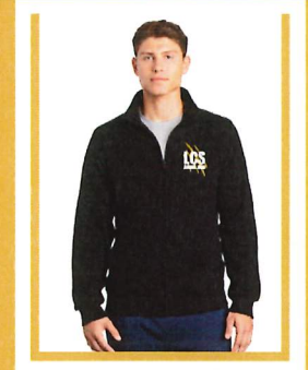
FULL ZIP DOES NOT HAVE CLAW MARK COMES IN BLACK, ADULT ONLY ST259ADULT S-XL $57.00 ADULT 2XL $59.00