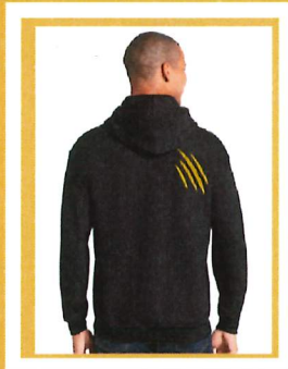
CLAW ON THE BACK OF ALL SWEATSHIRTS