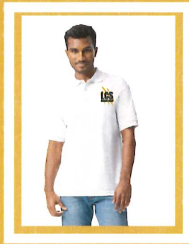
STANDARD POLO COMES IN GOLD, BLACK, WHITE Y500 YOUTH M-XL $27.00 K500 ADULT S-XL $29.00 ADULT 2XL $32.00