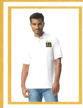
BASIC POLO COMES IN BLACK, WHITE 8800B YOUTH M-XL $23.00 8800 ADULT S-XL $25.00 ADULT 2XL $27.00