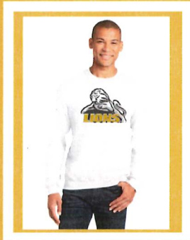
CREW COMES IN GOLD, BLACK, ATH.GREY, WHITE 18000B M-XL YOUTH $40.00 18000 S-XL ADULT $44.00 ADULT 2XL $ 47.00