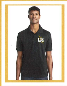
DRI FIT POLO COMES IN BLACK OR WHITE YST640 YOUTH M-XL $27.00 ST640 ADULT S-XL $29.00 ADULT 2XL $31.00